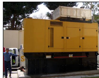
PERMIT™ Filter/Silencer Unit Installed on Diesel Back-up Generator