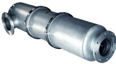
PERMIT™ Filter Industrial Design