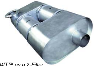
PERMIT™ as a 2-Filter Industrial Design