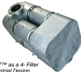
PERMIT™ as a 4-Filter Industrial Design