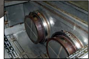
Inside view of Filter/Silencer Design Using 2 - PERMIT™ Filters