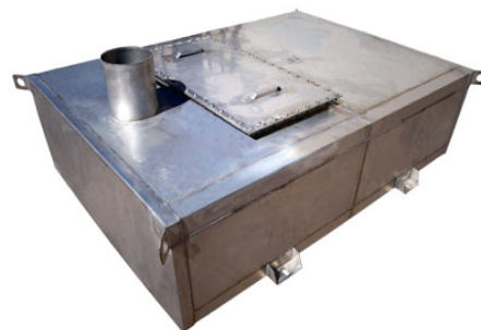
The PERMIT™ Filter/Silencer Unit manufactured by CleanAIR Systems utilizing an innovative light-weight design made with corrosion-resistant stainless steel.

The easy-to-install, CARB verified CleanAIR PERMIT™ Filter works with all diesel engines and diesel fuels for compliance with air quality regulations.