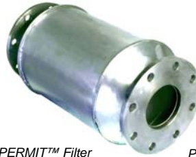
The PERMIT™ Filter with Bolt Flanges