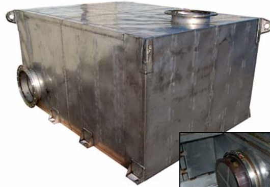
The PERMIT™ Filter/Silencer incorporating 10-filters within a corrosion-resistant stainless steel shell

Filter/Silencer replacement designs are available for applications requiring high levels of sound attenuation or multiple PERMIT™ Filters. The corrosion-resistant stainless steel shell has a removable panel, allowing full access to the filters mounted inside.