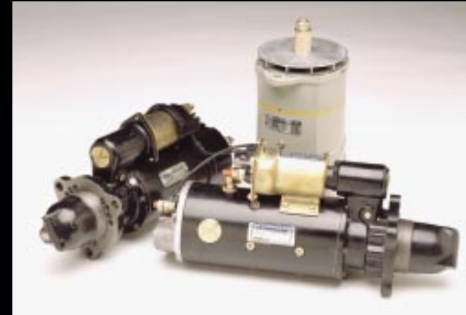
Our full line of new and remanufactured Cat Starters and Alternators helps you increase engine life and lower costs.